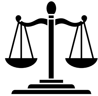
TABLE OF CONTENTS 1